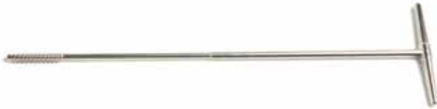
2.8mm cannulated T-handle 7.3mm tap