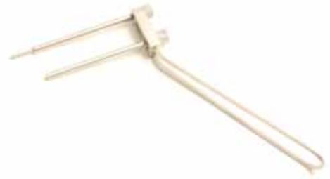
Parallel Drill Guide, 2.8mm (adjustable)