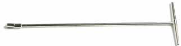
2.8mm cannulated T-handle countersink