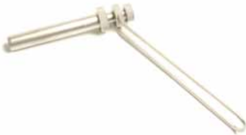
Drill Protection Sleeve 8.5mm/2.9mm