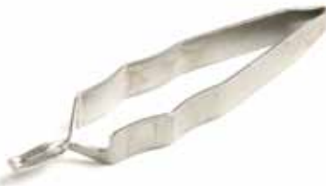
Screw forceps, self-retaining